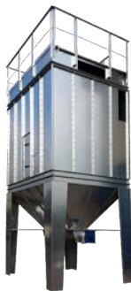
BERF Baghouse rectangular filter

Air volume : Up to 80000 m³/h Vacuum : Up to 5000 Pa Filter area : 109 up to 600 m²