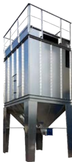
BERF Baghouse rectangular filter

Air volume : Up to 80000 m³/h Vacuum : Up to 5000 Pa Filter area : 109 up to 600 m²